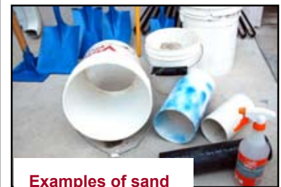
Examples of sand sculpting tools